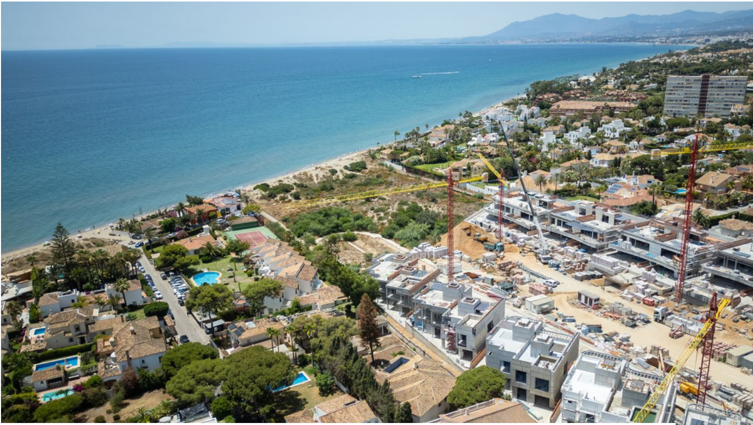
Playas Andaluzas - Basement