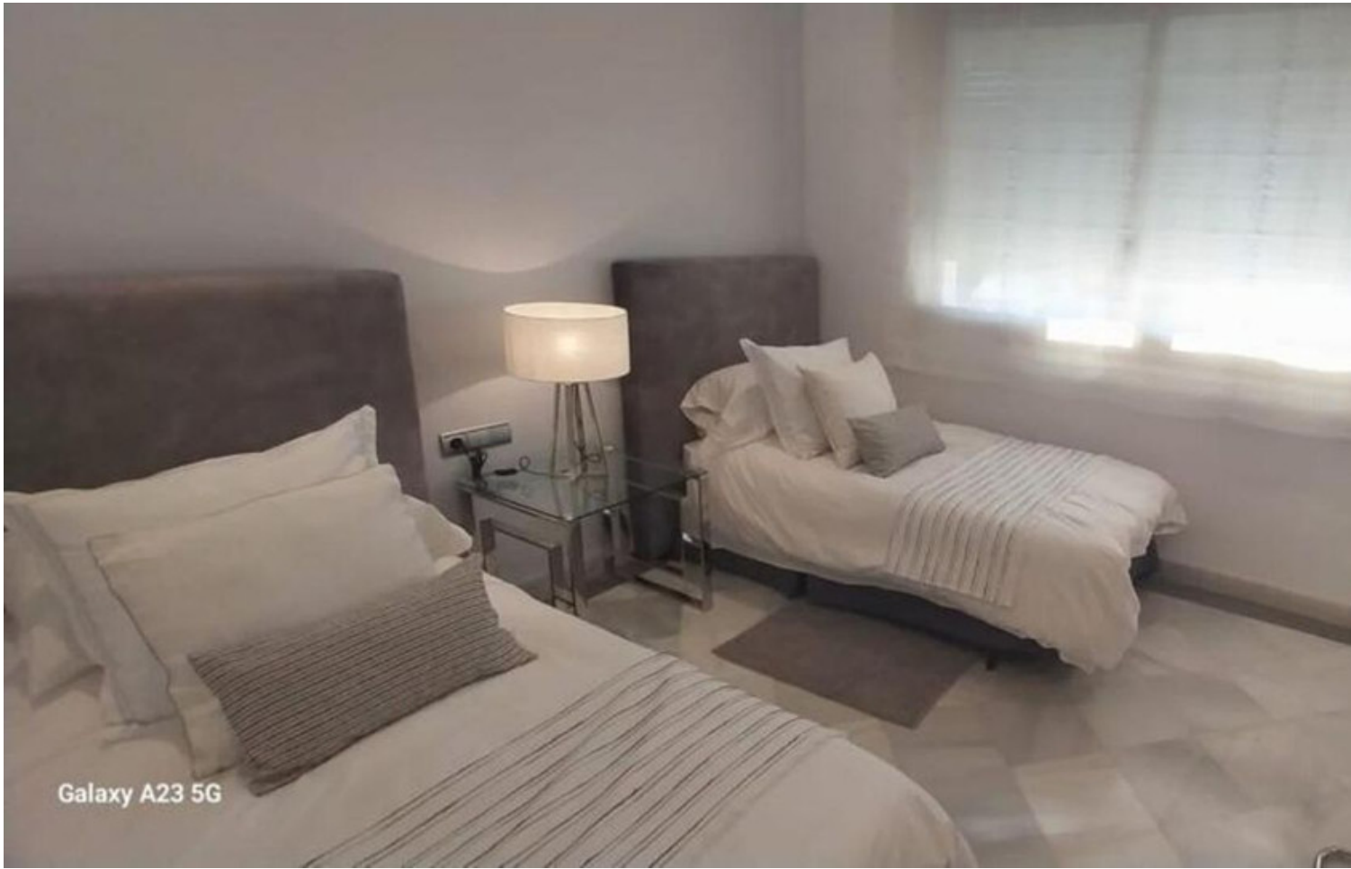
Galaxy A23 5G