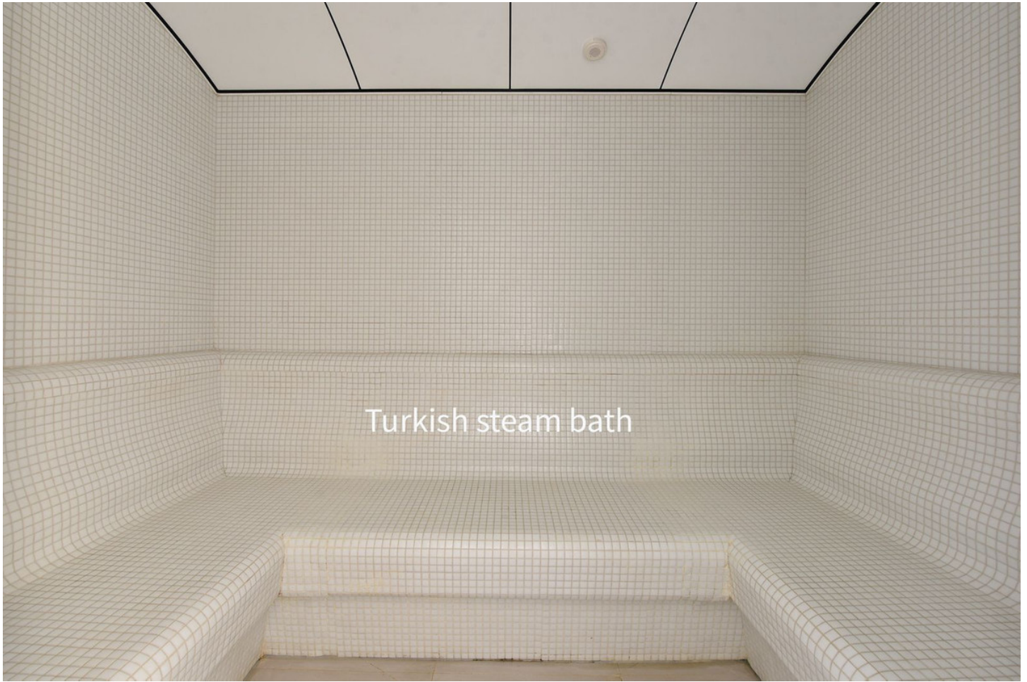
Turkish steam bath