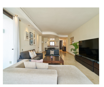
Ref.-ID: MIBGR4861162 Marbella Апартамент