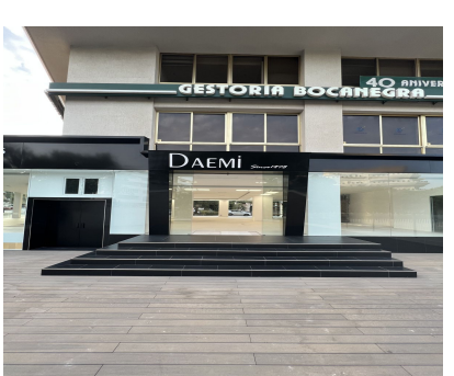
Ref.-ID: MIBGR4104610 Marbella Коммерческая

Коммунальные: 10,800 EUR / год ИБИ: 8,380 EUR / год