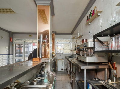
Ref.-ID: MIBGR4268800 Mijas Коммерческая