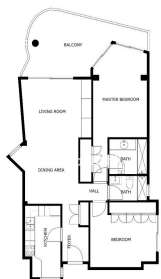
SCALE AND APPROXIMATE ACTUAL MAY VARY