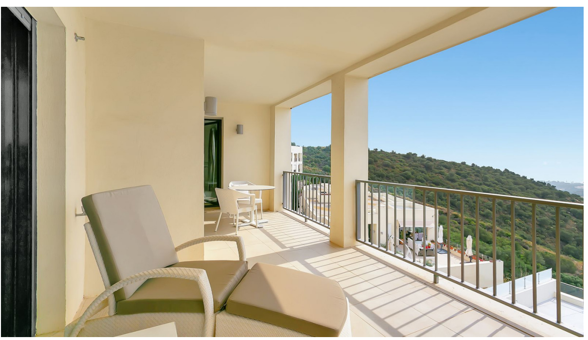
Altos de los Monteros