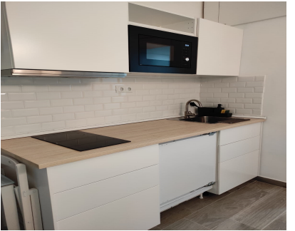
Коммунальные: 180 EUR / год