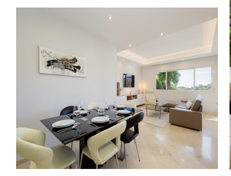
La Mairena Апартамент