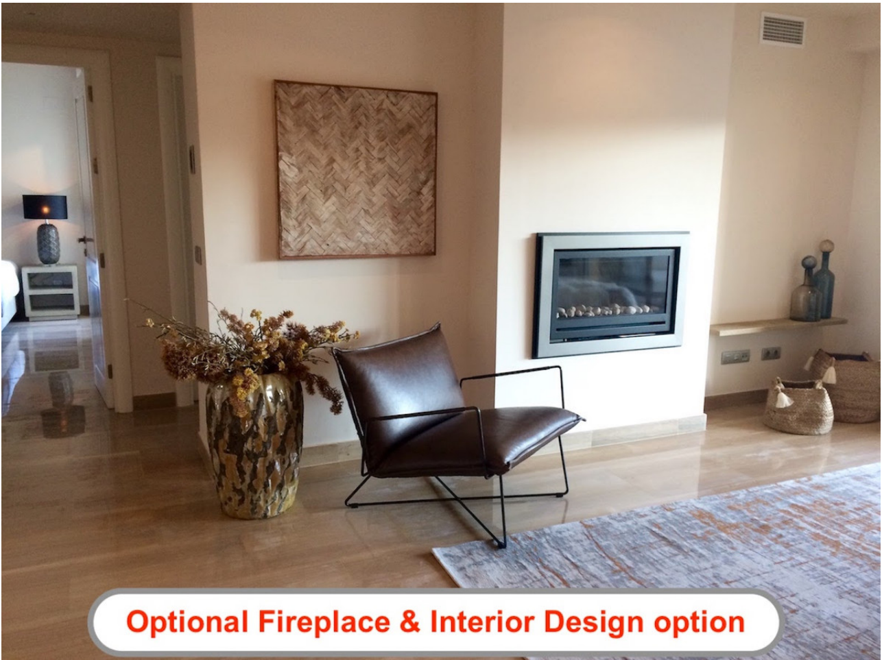
Optional Fireplace & Interior Design option