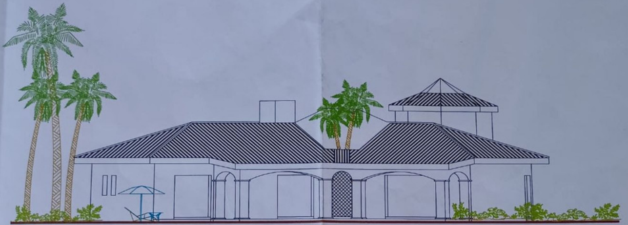
ALZADO SUR OESTE.