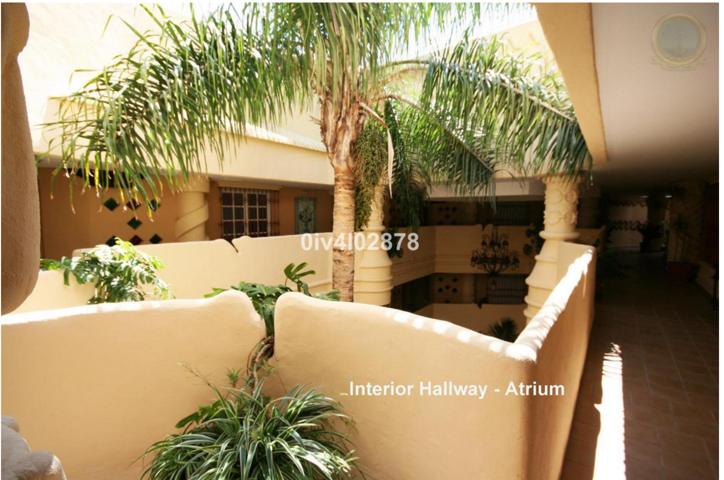
Interior Hallway - Atrium