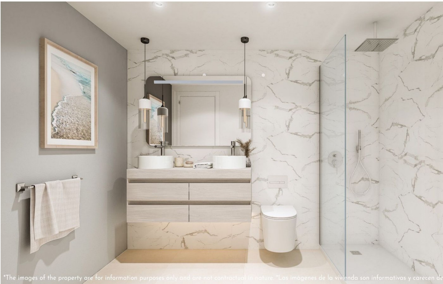
*The images of the property are for information purposes only and are not contractual in nature. *Las imágenes de la vivienda son informativas y carecen de