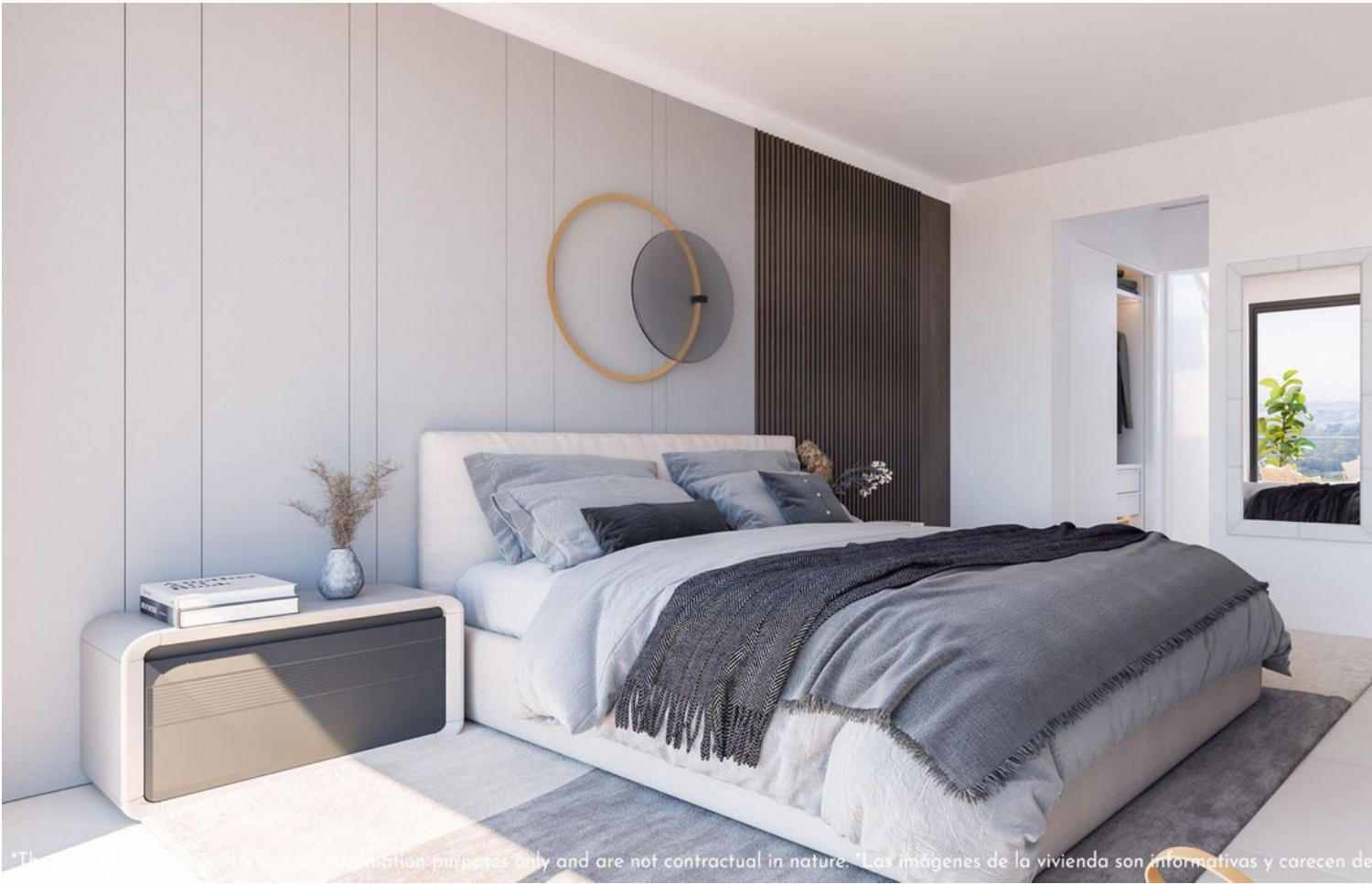
*The images of the property are for information purposes only and are not contractual in nature. *Las imágenes de la vivienda son informativas y carecen de