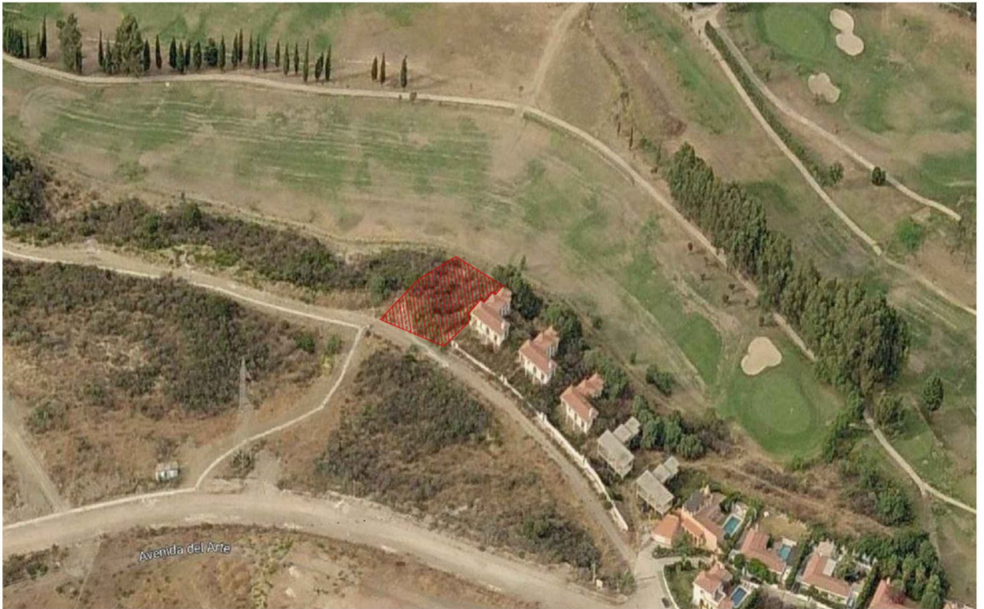
ORTOFOTO VISTA DE PÁJARO ⓘ