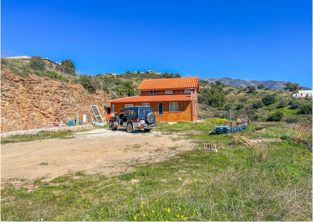
NOT TO SCALE Main house