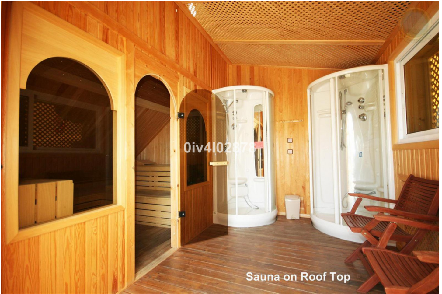
Sauna on Roof Top