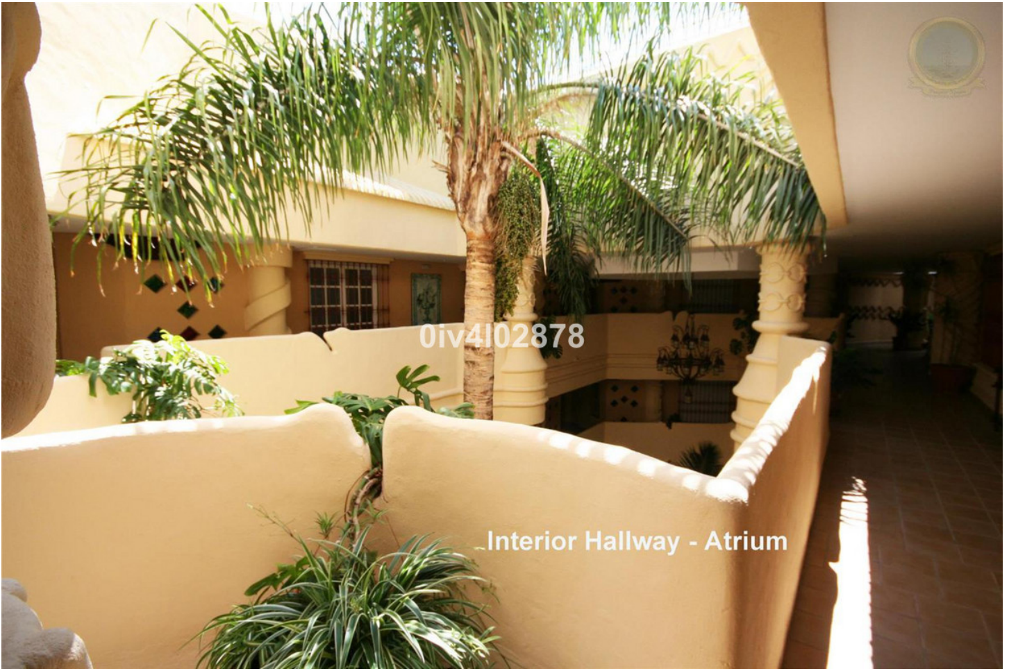
Interior Hallway - Atrium