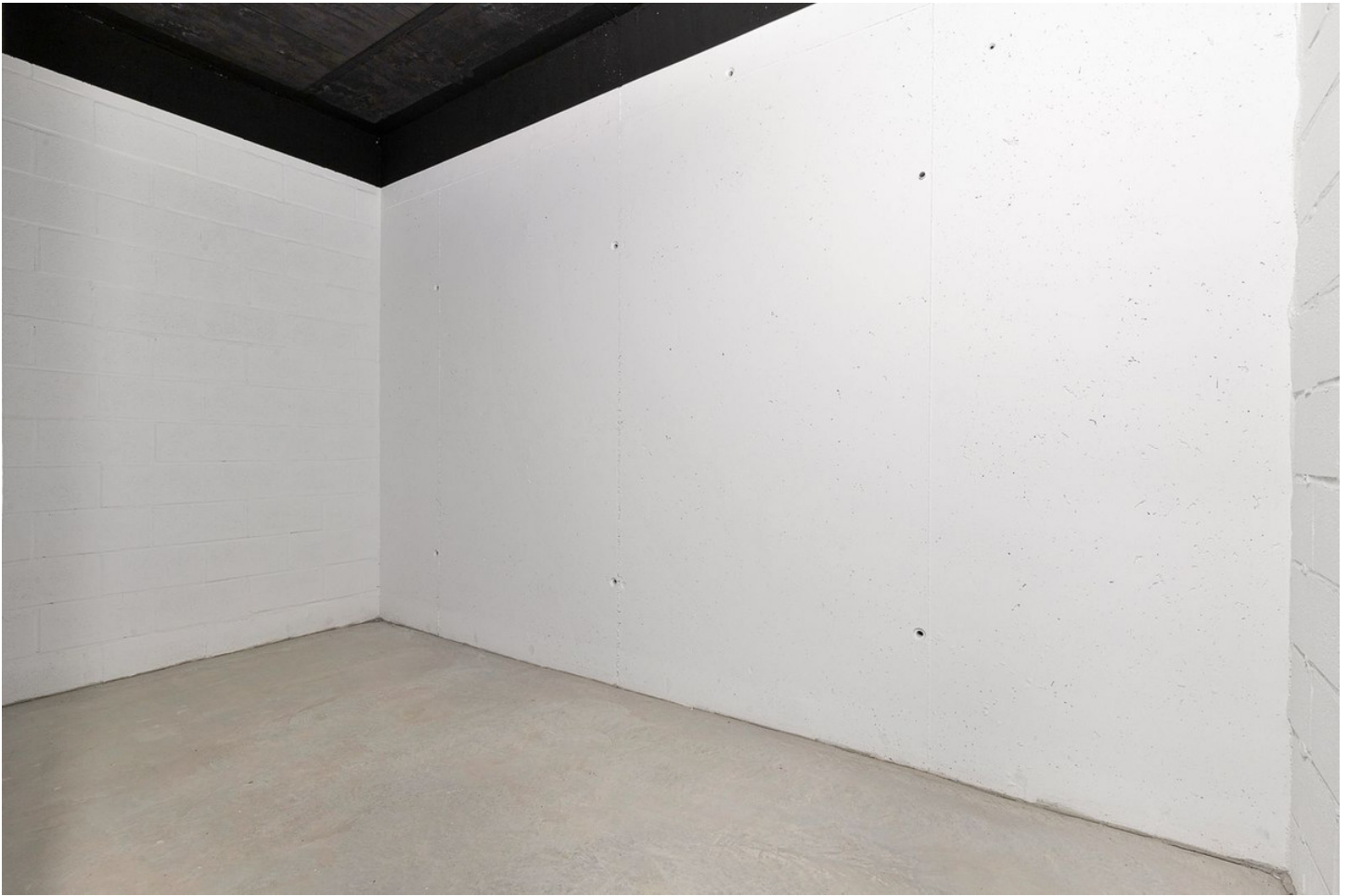
APARTMENT 5531 | FURNITURE LAYOUT