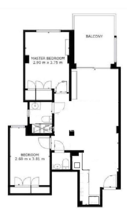
GROSE INTERNAL AREA FLOOR 1. 58 -/. ENCLUDED AREAS EALCONY 8 -// TOTAL: 58 -//