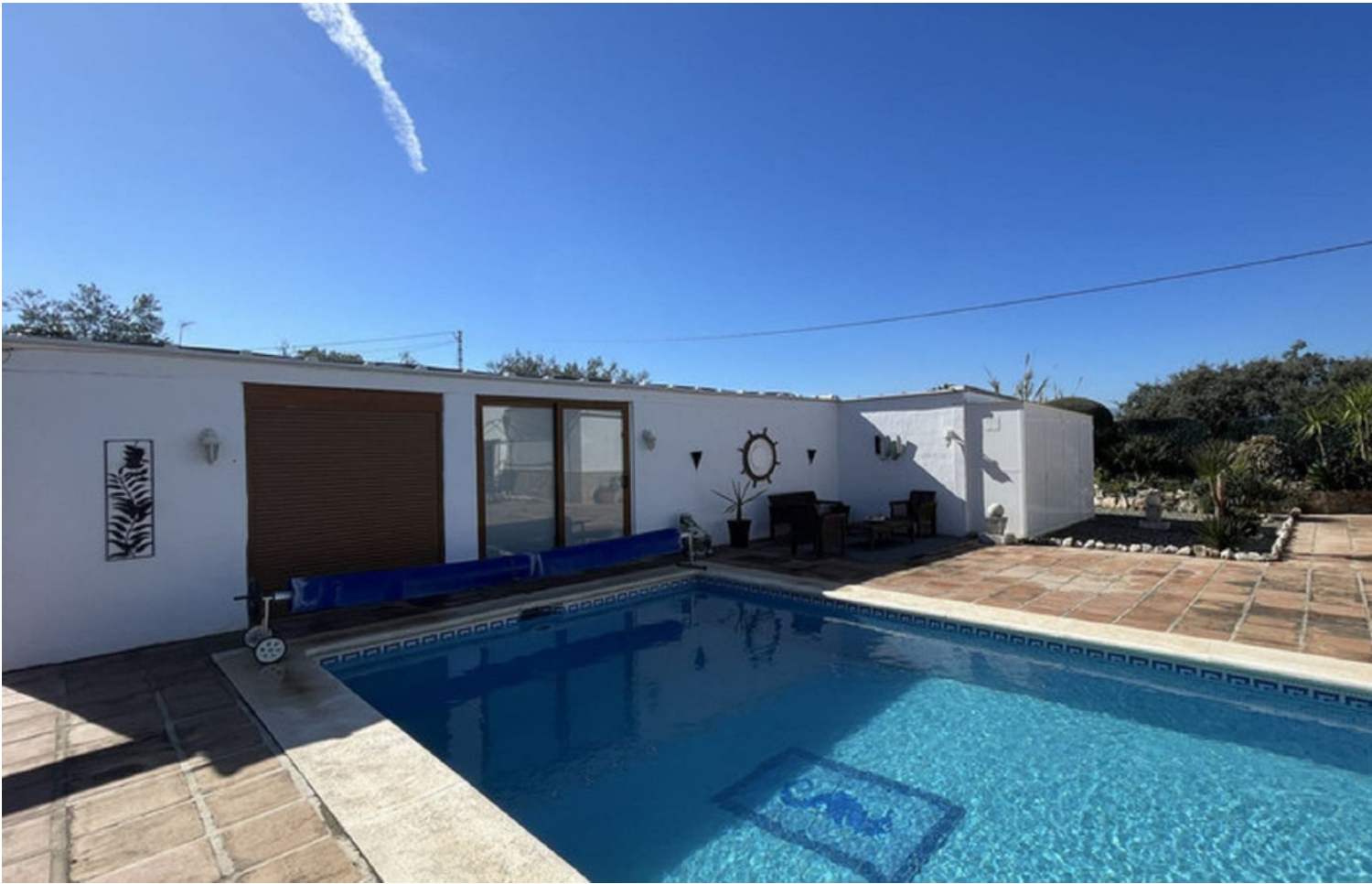
HOUSE 1 Vivienda